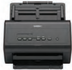
Business Document Scanners