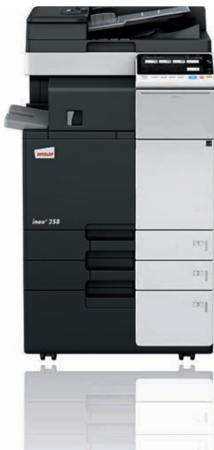
ineo+ 258 fitted with inner finisher

The future is mobile. Mobile working habits are becoming increasingly common in office environments. Smartphones and tablets have enabled new ways of working, yet numerous documents still need printing or scanning. In many companies this is only possible on a desktop PC, which forces mobile workers into a time consuming and inconvenient detour instead of printing or scanning directly from their mobile device. To solve this problem, DEVELOP brings you the ineo+ 368 Series, a colour office system equipped to fully support mobile working habits.