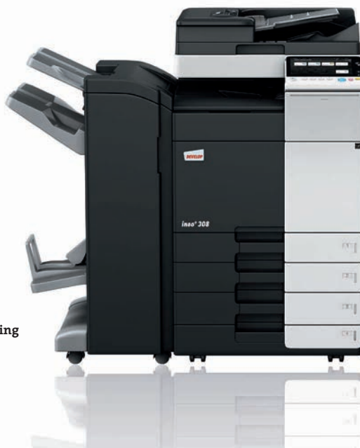
ineo+ 308 fitted with booklet-making finisher and 4-tray paper input