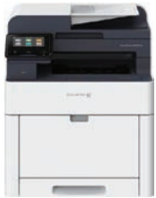
DocuPrint CM315 z