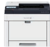
DocuPrint CP315 dw