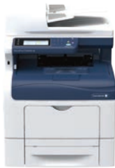
DocuPrint CM405 df