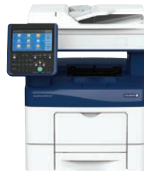
DocuPrint CM415 AP