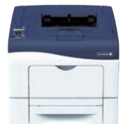
DocuPrint CP405 d