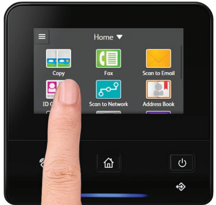
DocuPrint CM315 z 4.3" Colour Touch Screen

The built-in USB port makes walk-up functionality simple, allowing you to print and scan to and from a USB memory stick without the need of a PC.