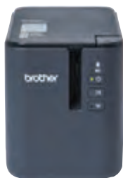
High-Volume Office Labellers