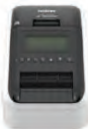
Professional QL Labellers