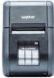
Rugged Receipt and Label Printers