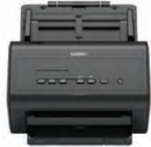
Business Document Scanners