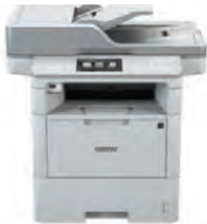
Professional Monochrome Laser Devices