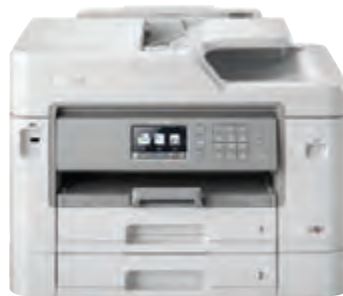
Business Inkjet Devices