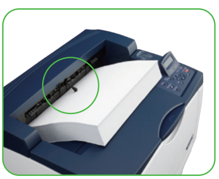
Smart features. The full stack sensor eliminates paper jams caused by a full output tray.