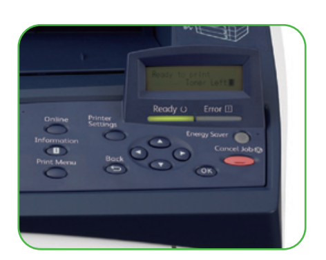
Easy to use interface. The DocuPrint 3105 has a simple to use interface allowing quick access to printer functions.

Say goodbye to paper jams due to excessive amounts of print outs in the output tray. The DocuPrint 3105 comes standard with a full stack sensor. It stops the operation once the tray is full, allowing the operator to remove the printed items from the output tray and resume printing.